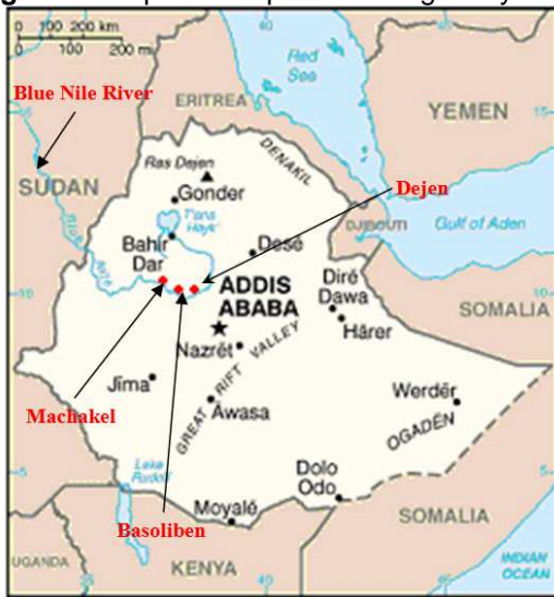
Figure 1. Map of Ethiopia indicating study sites.

Samples were collected from cattle from the Dejen, Machakel, and Baso-liben districts of the East Gojjam zone bordering the Blue Nile River; each of these districts is located on the edge of the tsetsebelt (Figure 1). Chemotherapy is the only trypanosomosis control method used in the study areas. Veterinary supervision is inadequate, which may lead to the inappropriate use of drugs or use of drugs of substandard quality.