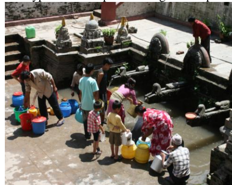
Figure 3. Some residents of Patan, Kathmandu, collecting water from a typical municipal drinking water spout.