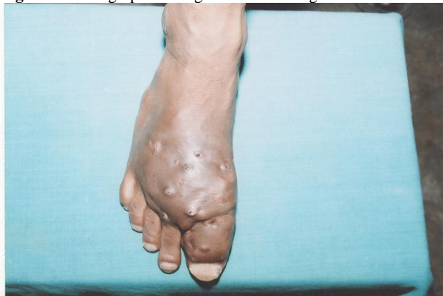
Figure 1. Photograph of the growths on the right foot.

Simultaneously the sample was inoculated on plain Sabouraud's dextrose agar, 10% sheep blood agar and brain heart infusion broth. Sabouraud's dextrose agar was incubated at 25°C and 37°C and the samples were examined daily. Inoculated blood agar plates were incubated under aerobic and anaerobic conditions. On the tenth day of incubation a growth was seen on blood agar, which was incubated aerobically. The colony was glabrous, waxy, heaped and folded in appearance. The colour of the colony was initially white and later changed to a tan colour. As anticipated, Gram stain revealed gram-positive branching filaments from the growth (Figure2).