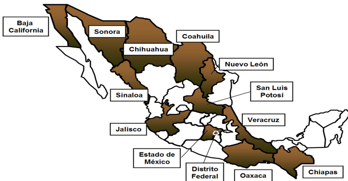
Figure 1. States of Mexico reporting resistance of M. tuberculosis to first-line anti-TB Drugs up to and including 2006.

observed for MDR with rates of 1.6% and 23.8% for primary and secondary MDR, respectively [4].