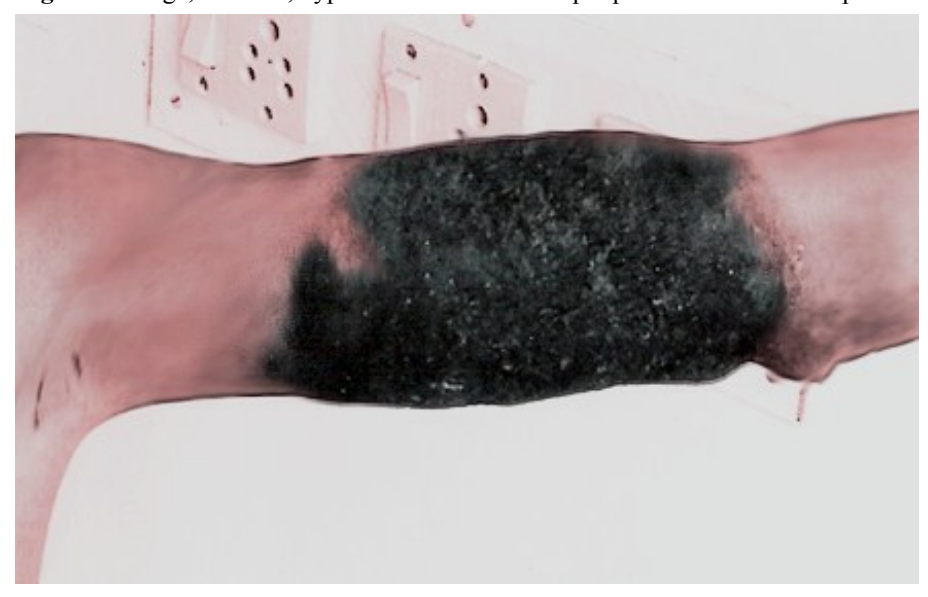
Figure 1. Large, necrotic, hyperkeratotic verrucous plaque on left arm of the patient

investigations. Aerobic and anaerobic bacterial cultures of the biopsy tissues showed no growth. The biopsy tissue was negative for acid fast bacilli by Ziehl Neelsen staining. A hematoxylin and eosin stained section of the biopsy material revealed chronic granulomatous lesions with areas of central necrosis suggestive of tubercular granuloma. Skin biopsy sections sent to a super-specialty hospital in Bangalore also confirmed the same findings.