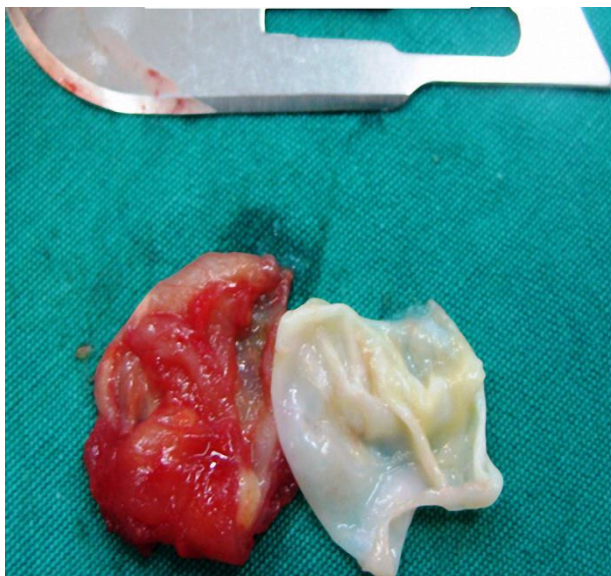
Figure 2. The excised cyst and its germinative membrane

biopsy showed a hydatid cyst with germinative membranes. (Figure 2) Tissue samples, prepared for microscopic examination by fixation with 10% formalin, alcohol and immersion in paraffin blocks, showed eosinophilic staining of the lamellar cuticular membrane and cyst wall surrounded by granulomatous inflammation. These findings supported the diagnosis of a hydatid cyst. The patient had an uneventful postoperative period. Lung, abdomen and brain tomography scans, whole body bone scintigraphy and hydatid serology, including indirect haemagglutination and enzyme-linked immunosorbent assay, were all negative. An isolated axillary hydatid cyst was therefore diagnosed. Treatment with albendazole was started when the patient was discharged from the hospital. It has been one year since her surgery and follow-up examinations have shown no relapse.