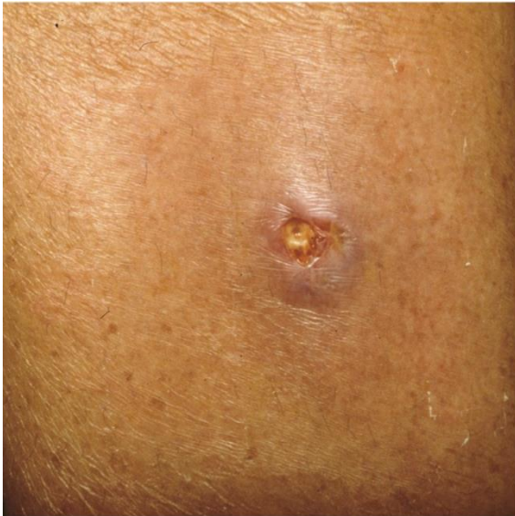
Figure 1. Patient 1. Nodular-ulcerative lesion at the right leg