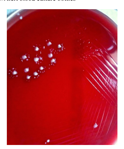
Figure 1. Colonies of Granulicatella adiacens on 5%sheep blood agar (0.2-0.5mm), satelliting around opaque, white, large colonies of Diphtheroids after subculture from BacT/Alert blood culture bottles

Based on blood cultures, antimicrobial therapy was initiated with intravenous ceftriaxone (1 gm) and gentamicin (80 mg) twice daily for four weeks. The patient made an uneventful recovery by the fourth week.