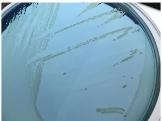
Figure 1. V. fluvialis colony appearance on cysteine lactose electrolyte deficient medium 48 hours.

diarrhea and septicemia through tissue damage, increase in intestinal secretion, and destruction of red blood cells and some types of white blood cells [1,2,4].