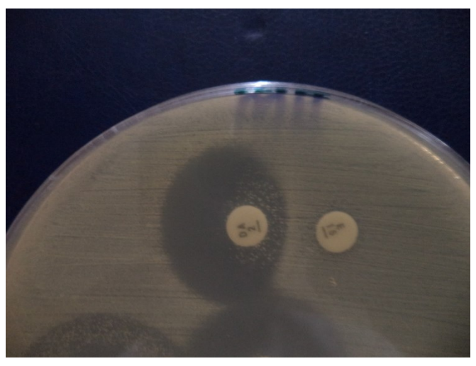
D shaped zone of inhibition due to the inducible clindamycin resistance.

Figure 1. Characteristic of inducible clindamycin resistance D-test.