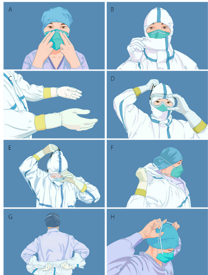
2A. Press the metal strip to the bridge of the nose when wearing the mask; 2B. Stick the glue strip on the neckline; 2C. Fix the gloves with adhesive tape; 2D. Cover the lower edge of the protective cap and the upper edge of the mask with the goggles; 2E. Grasp the outer edge of the goggles and then remove the goggles; 2F. Start to remove the protective clothing; 2G. Remove the protective clothing, keeping the clean inner side of the clothing outward; 2H. Take off the mask in a way that avoids touching the outer surface of the mask.