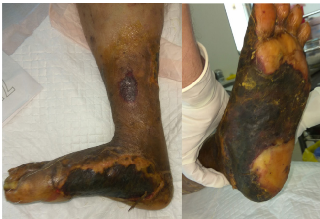
Figure 2. Bilateral lower limb debridement.