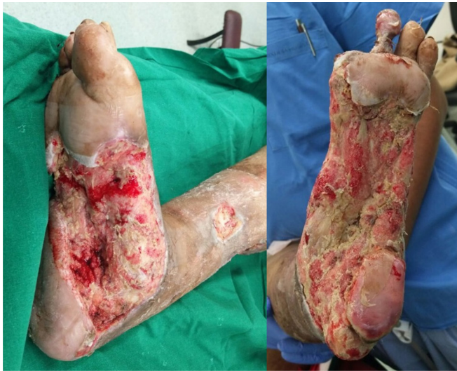
Figure 3. Recurrence of soft tissue necrosis.

year old known diabetic with peripheral vasculopathy. She presented with bilateral lower limb diabetic gangrene (Figure 1) and was managed with debridement and negative pressure wound therapy (Figure 2). The tissue cultures grew pseudomonas aeruginosa and was treated with appropriate antibiotics. The patient and relatives refused the surgical recommendation of bilateral below knee amputation which was advised taking into account the poor wound status, decreased vascularity. The wound