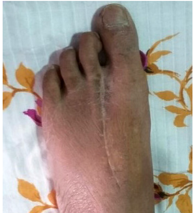
Figure 7. Healed 2nd ray amputation with no local recurrence.

culture, inconclusive histopathology, microscopic invasion of fungi in the tissues and vasculature beyond what seems to be macroscopically normal tissue, poor bone penetration of antifungals and immunocompromised state amongst others [2–5,7,10–13]. This variability in results is distinctly highlighted in our case who underwent a second ray amputation following local recurrence [14]. This case highlights the need for a prolonged follow- up of patients with fungal infections due to the propensity for recurrences. Institutes all over the world are battling to setup a systematic protocol to ensure early detection and good outcomes. However, there is yet no consensus on the