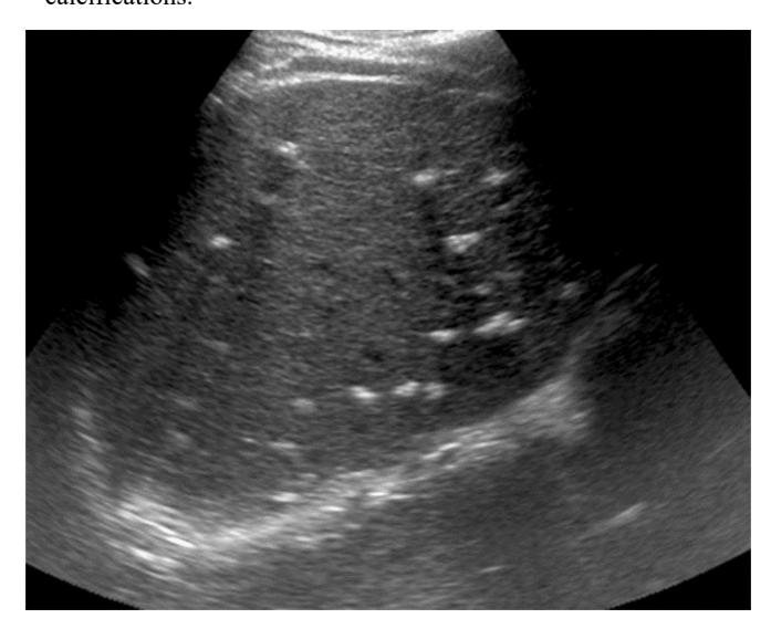
Figure 1. Hepatic ultrasound showing multiple disseminated calcifications.

abdominopelvic computed tomography was performed confirming multiple comma-shaped calcifications disseminated in the liver and the peritoneal cavity, without any additional features (Figures 3 and 4).