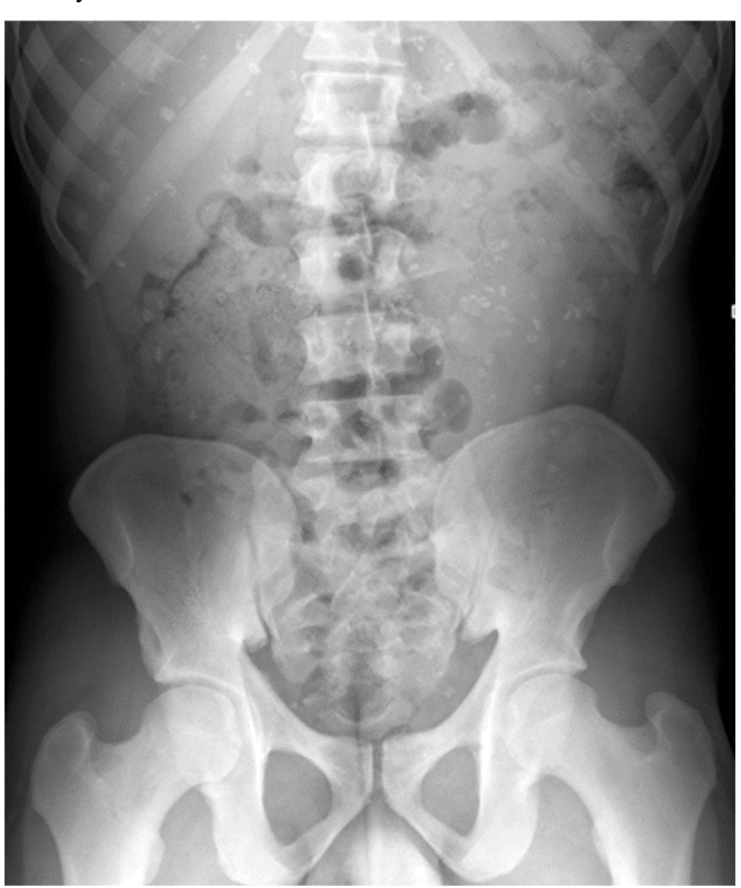
Figure 2. Plain radiograph of the lumbar spine showing calcifications in the projection of the liver and in the peritoneal cavity.

radiologist who was a native of West Africa and doing an internship in our department. When inspecting the images, she asserted, without any doubt, «This patient eats snakes!». When the patient was asked about this, he confirmed that he went on regular trips to Africa, where he would usually consume snake meat.