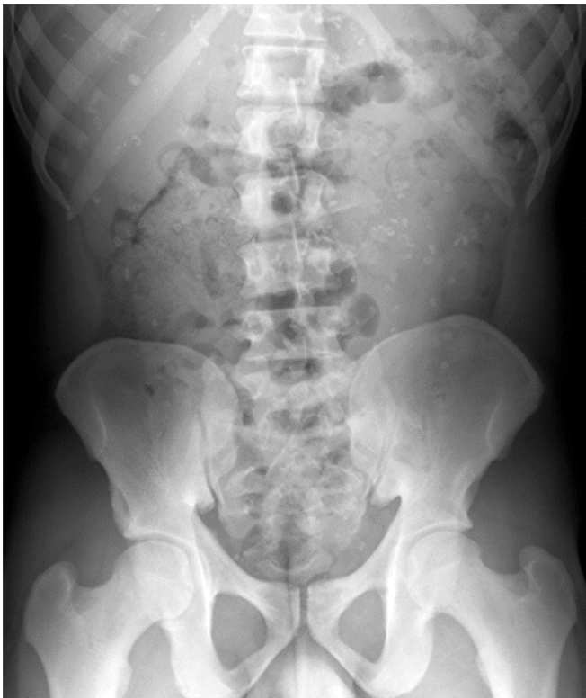
Figure 2. Plain radiograph of the lumbar spine showing calcifications in the projection of the liver and in the peritoneal cavity.

radiologist who was a native of West Africa and doing an internship in our department. When inspecting the images, she asserted, without any doubt, «This patient eats snakes!». When the patient was asked about this, he confirmed that he went on regular trips to Africa, where he would usually consume snake meat.