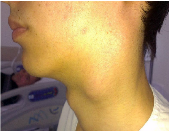
Figure 2. The neck abscess in the 17-year-old male.