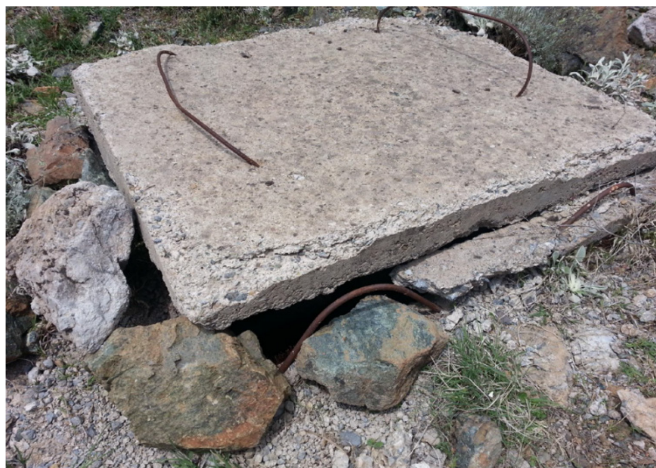
Figure 3. Photo showing one example of the status of water sources.

Drinking-water contamination is one of the major causes of tularemia outbreaks in Turkey; and many variable factors are major causes of drinking-water contamination, including the lack of an appropriate water infrastructure. Problems with the tap water network infrastructure —such as unprotected water sources, open transfer of water, and superficial lining of the water supply pipes— have been reported in outbreaks [3,8,13,23,24]. Physically insufficient or dirty water reservoirs have also been reported in previous tularemia outbreaks [13,23-25,28]. Previous investigations have found that infrastructural and sanitation problems persisted in recurrent outbreaks [11,25]. In one outbreak report, there was a complete