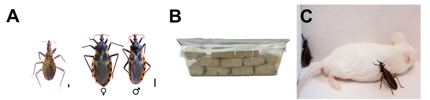
Figure 1. T. dimidiata from Los Mezcales, Chiapas, México. A, nymph and female and male adults of T. dimidiata (bar for each bug structure is as follows: nymph = 1 mm; adult = 5 mm); B, blocks of adobe to maintain bugs in the laboratory; C, Feeding of T. dimidiate bugs with blood of an anesthetized mouse.

The insects were collected in plastic jars for their transportation to the laboratory, where they were kept in polycarbonate cages containing 15–18 adobe bricks and covered with mesh (Figure 1B). To feed the insects, healthy Balb/c mice (males and females 3-4 weeks of were anesthetized with xylazine (10)age) mg/kg)/ketamine (80 mg/kg) (following recommendations of Mexican National the Commission of Bioethics) and insects were allowed to feed on their blood for up to 20 minutes (Figure 1C). After feeding, the insects' feces were deposited on a sodium chloride solution (0.9% NaCl), and the presence of trypomastigotes in feces samples was analyzed using