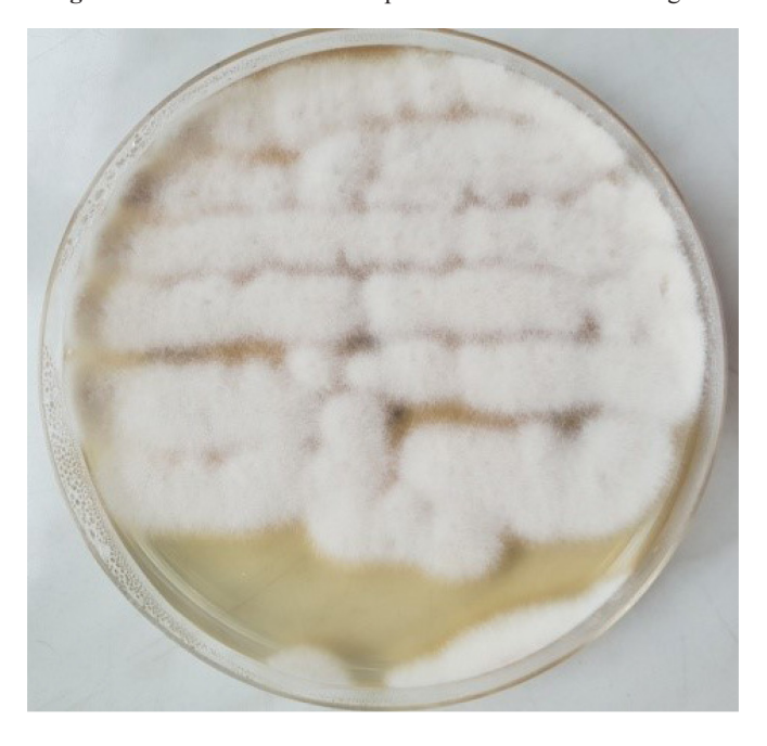
Figure 1. Growth of Fusarium sp. on Sabouraud dextrose agar.

therapy, fluconazole, the only available drug in our hospital was administrated. Unfortunately, patient left the hospital treatment at his own request and after a few days, he was re-admitted to the hospital, 40 days after the first hospitalization.