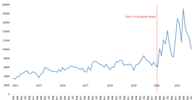
Figure 1. Number of sold units of azithromycin before and after the onset of the first case of COVID-19 in Brazil.

8,275 units in October to 16,852 units, making an increase of more than 100% in just 60 days.