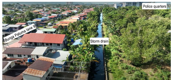
Figure 2. An image was taken using a drone showing dense vegetation in between two localities.

high-rise structures. Using automatic mode is only recommended to be used in large unobstructed places that have no tall structures and other sorts of interferences. This is why it is widely used in agriculture [10,11] and in malaria-affected swamp areas [8,12] for spraying insecticides. However, further study should be carried out to find the actual effectiveness of the use of drones in larviciding for dengue vector by using a manual mode to fly the drone to reach the containers with larvae.