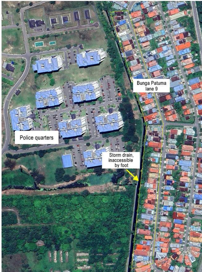
Figure 1. Yellow arrow showing Bunga Patuma Lane 9. Larviciding was to be carried out along the yellow line.

inaccessible by foot. It was impossible to ascertain breeding sources in this area.